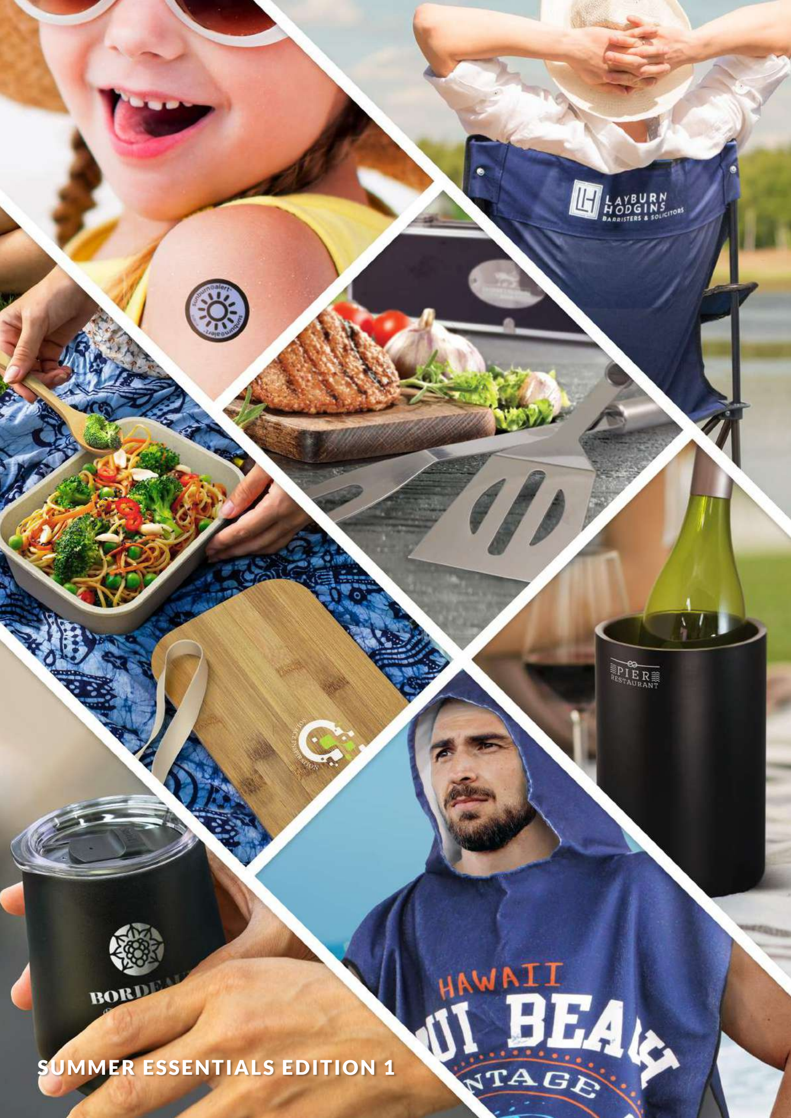
SUMMER ESSENTIALS EDITION 1